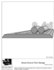
Figure IV-5.5: Above-Ground Tank Storage