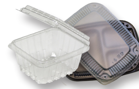
Plastic Trays and Clamshells

Not accepted for curbside or facility recycling