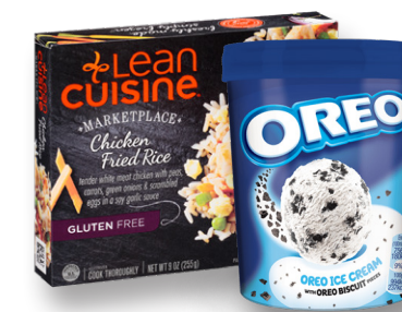
Frozen Food Containers