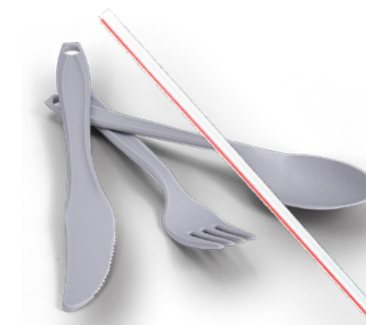
Utensils and Straws