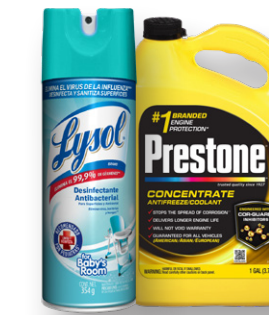
Household Hazardous Waste