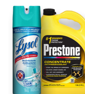
Household Hazardous Waste