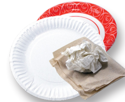
Paper Towels, Napkins and Plates