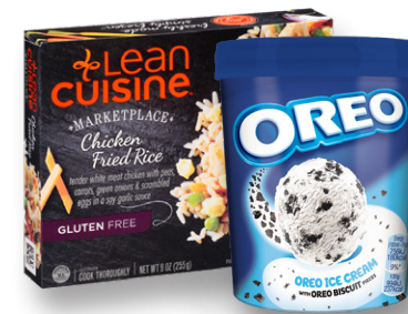
Frozen Food Containers